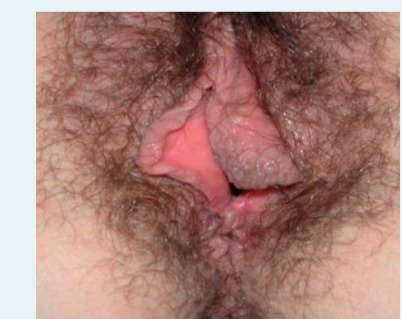
Used with permission of M Goodman (2013). drmichaelgoodman.com