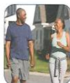
Be Physically Active