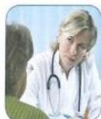
Be Involved in Your Health Care