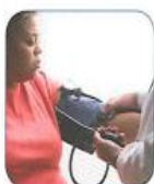
Get Recommended Screening Tests & Immunizations