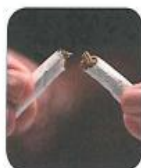
Be Tobacco Free