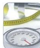
Strive for a Healthy Weight